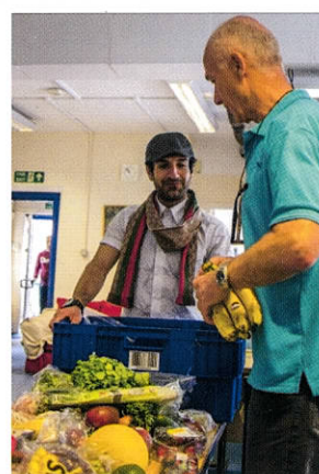
Food bank delivery

Asylum Welcome provide a range of services to